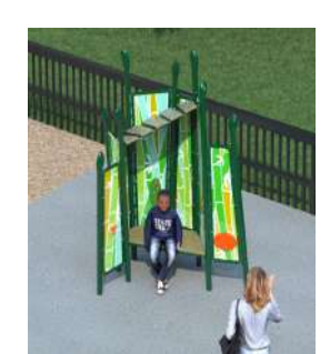
Quiet Grove $12,000