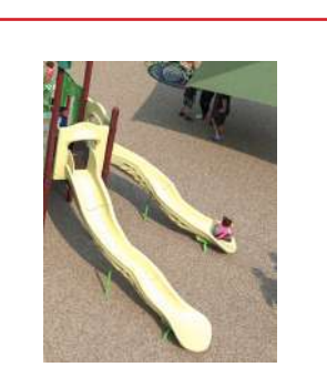
Double Slide $15,000