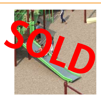
Roller Slide $12,000