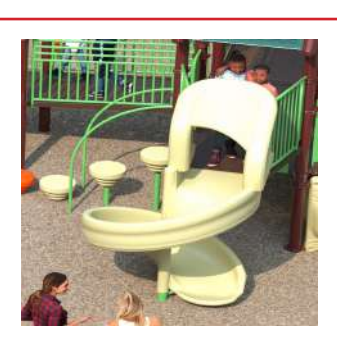
Spiral Slide $7,000