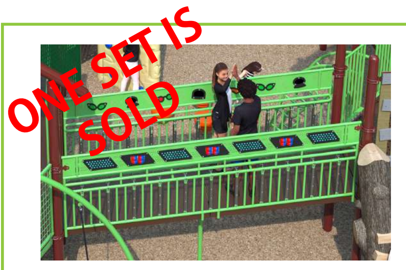
Sensory Safety Rails - two sets each set - $10,000