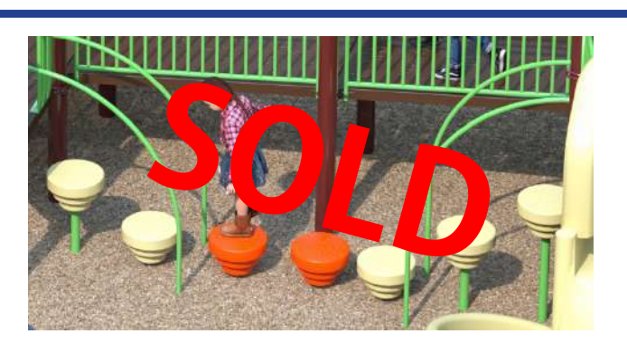
7 Stone Climbers $7,000