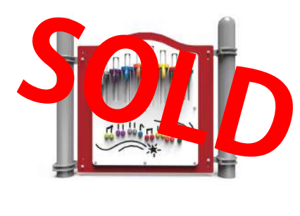
Scramble Scales Panel $5,000