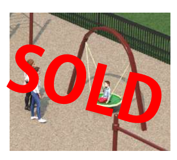
Dish Swing $18,000