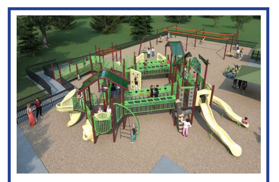
Inclusive playgrounds are for everyone! Come join us.