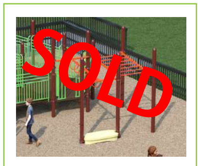
Double Monkey Bars $3,500

Your generous support will enable ALL children and caregivers of all abilities the opportunity to experience the joys and benefits of play. This destination playground will truly impact 10,000 people each year.