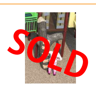
Tree Climber $6,000