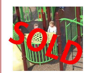
Disco Ball Party Panel $5,000