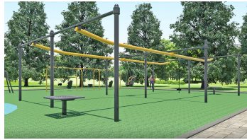
Rail Rider $17,000