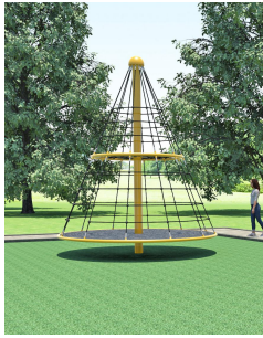
Zoom Twist $20,000