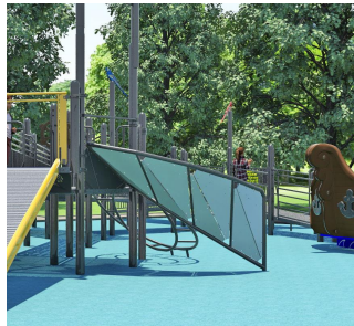
Tikes Peak $8,000