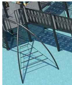
Walk the Plank $5,300