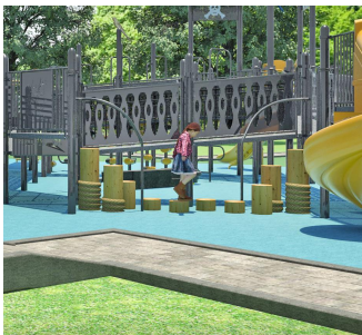
Log Climb $7,000