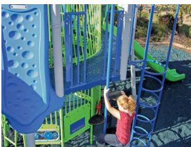
Fire Escape Climber $2,000