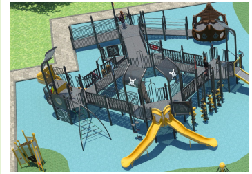
Name on Entryway of structure

Your generous support will enable ALL children and caregivers of all abilities the opportunity to experience the joys and benefits of play. This destination playground will truly impact ten thousand people each year.