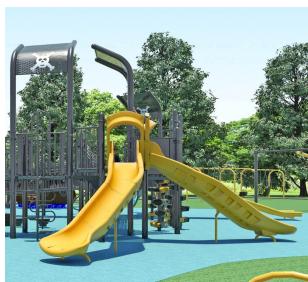
Double Entry Slide