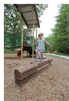
Balance Beam $1,100