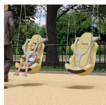
Inclusive Swing Seat $1,000