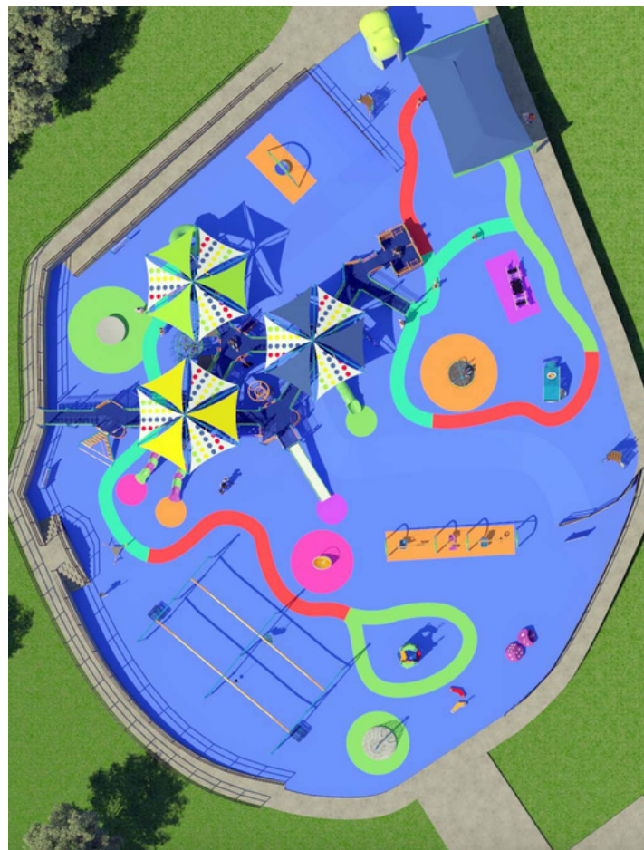
Overhead view of Teddy & Friends Inclusive Playground at Queeny Park